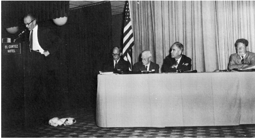
Fig. 6.4. The opening session of the San Diego Congress (1969). From left to right: